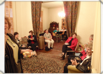
Recent Zonta event at the Kirkman House

As you plan your 2009 holiday festivities, remember that Kirkman House Museum is a wonderful venue for celebrations with your family, friends, co-workers and employees. Grand architecture, historic collections and flexible space make the museum a perfect site to host your party. Rental rates are affordable and include tables, chairs, exhibit space and private museum tours. For more information contact Greer Buchanan at gbuchanan@kirkmanhousemuseum.org .