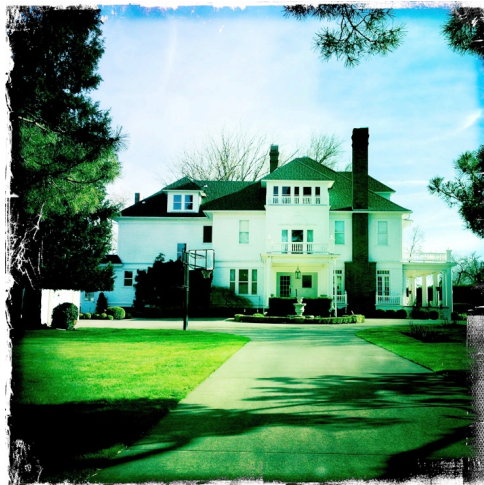
Baumeister house is our bonus house

If you would like to be a special part of this event, volunteer as a docent for the home tour by helping greet visitors or provide brief background on the homes for two and a half hours. Then you can enjoy the rest of the tour with a free pass. For more information, contact the museum at 509-529-4373.