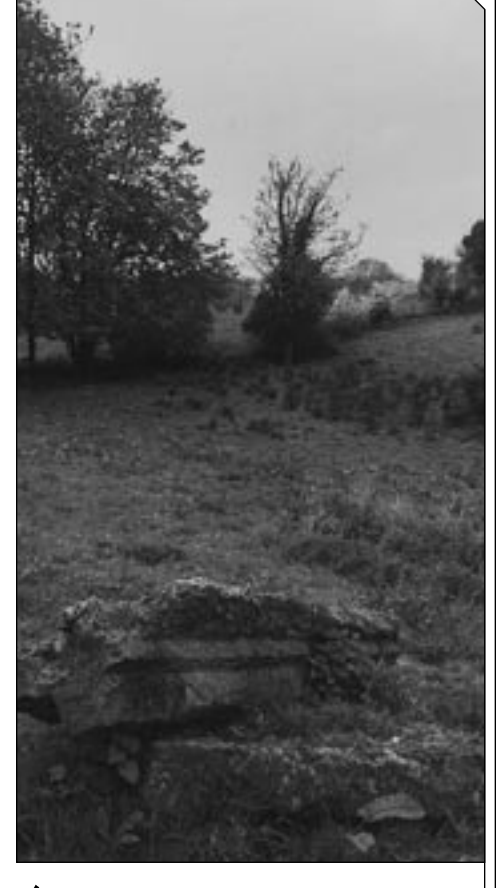
The remaining stones of Isabella Potts's family home.